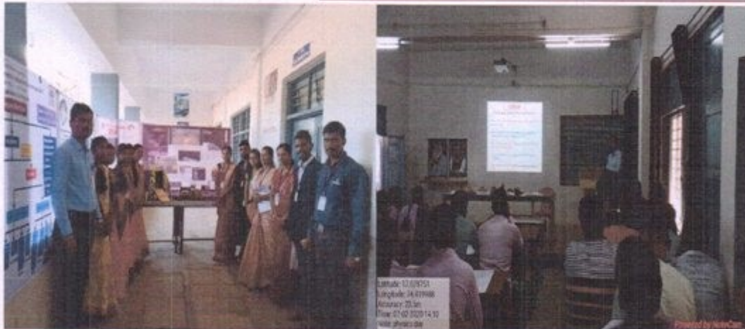
Students demonstrating models and flexes