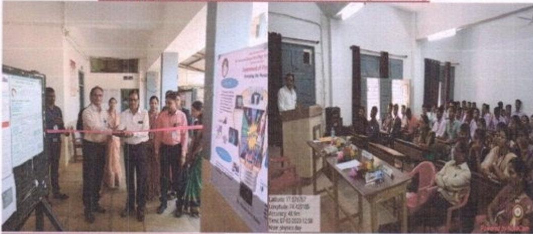
Inauguration of one day workshop